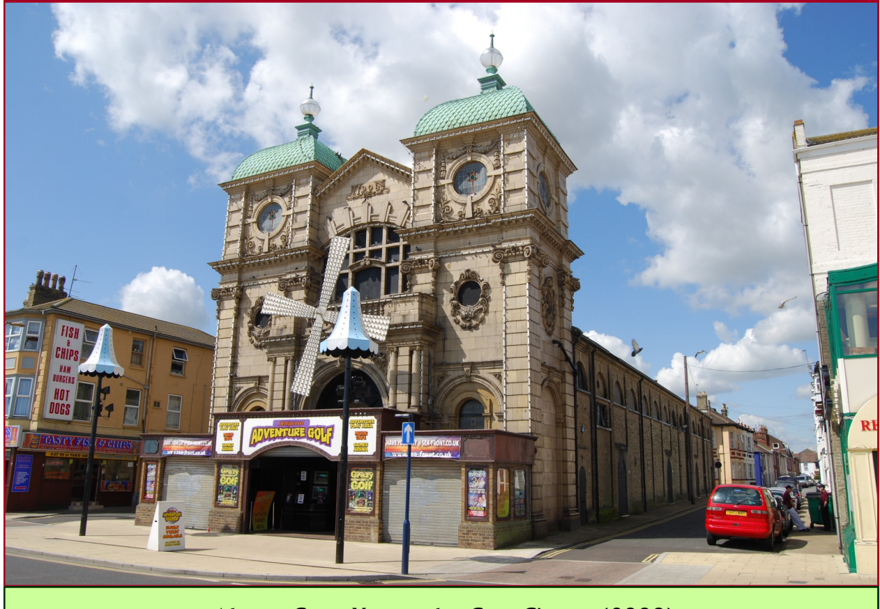
Above: Great Yarmouth: Gem Cinema (2009)