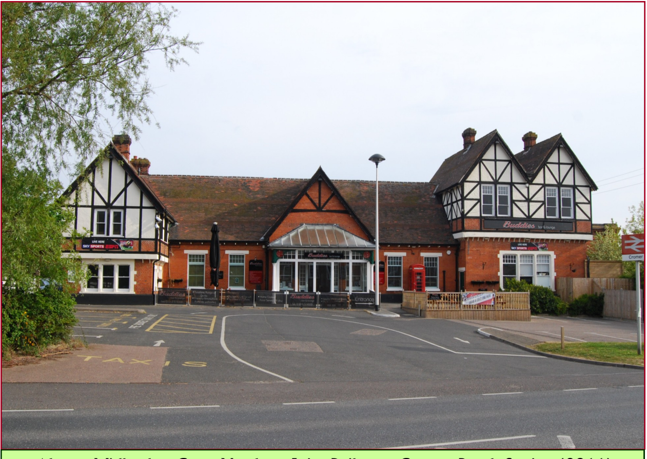
Above: Midland & Great Northern Joint Railway: Cromer Beach Station (2011)

The proposed Holt, Melton Constable & Fakenham Railway plans to reinstate continuous railway from Holt to Melton Constable, the core of the M&GNR system, continuing on to the M&GNR main line to Fakenham, where it would ultimately connect with the extended Mid-Norfolk Railway, currently a preserved line operating the former Great Eastern Railway line between Wymondham and Dereham, which has possession of the